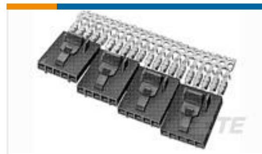
TE Part # 103959-3 5X4 MTE RCPT SR LATCH .100CL