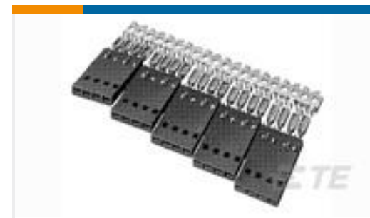
TE Part # 103968-3 5X4 MTE RCPT SR RIBBED .100CL