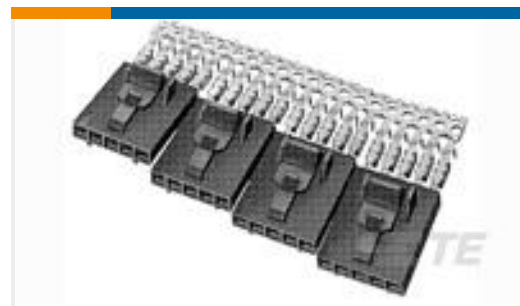
TE Part # 103956-3 5X4 MTE RCPT SR LATCH .100CL