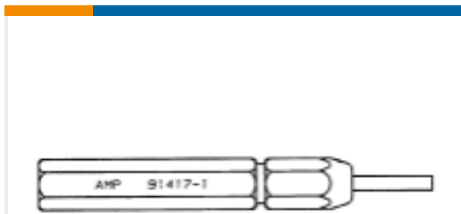
TE Part # 91417-1 TOOL, KEYING (AMPMODU MTE)