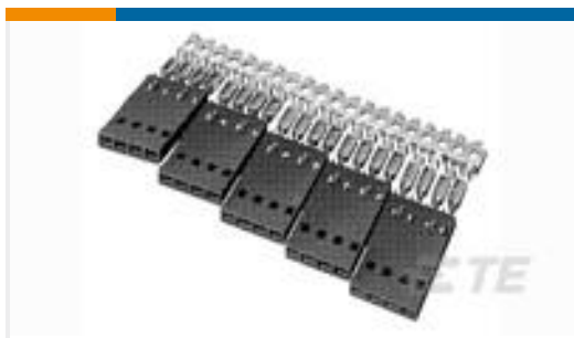
TE Part # 103971-3 5X4 MTE RCPT SR RIBBED .100CL